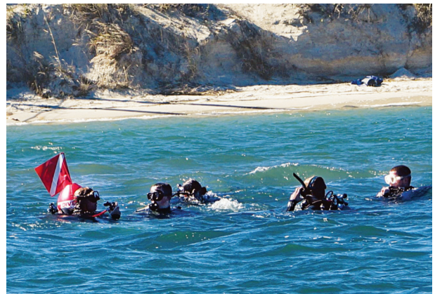
Love A Sea Turtle