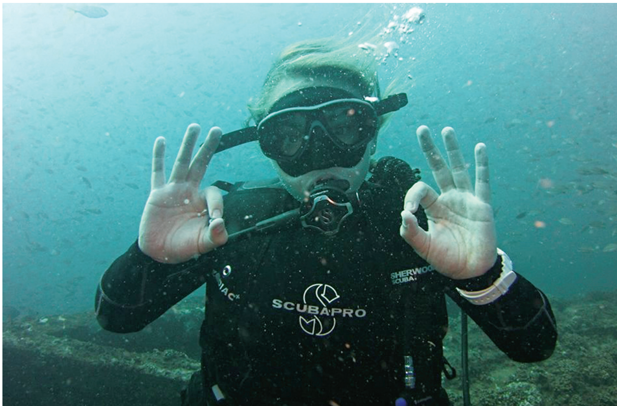
Rum Runner Dive Shop