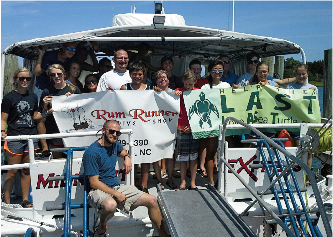
Love A Sea Turtle